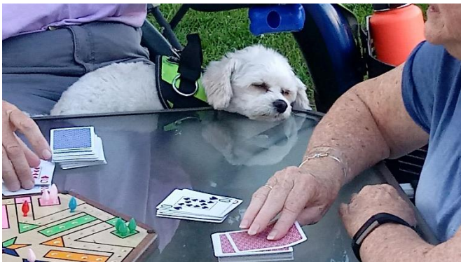
Truman enjoying a game of Fast Track