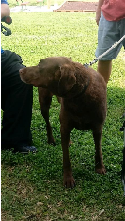
The newest member to our beloved pet's roster – Jake.