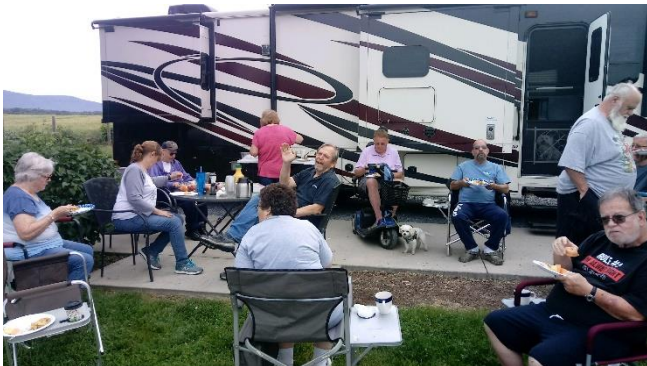
Breakfast at Joe's place