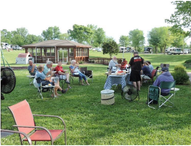
Dinner and meeting at site #21