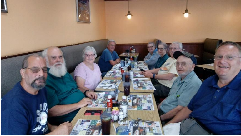
Walnut Bottom Diner