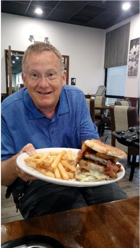
Hoss's Steak and Sea Restaurant One heck of a sandwich