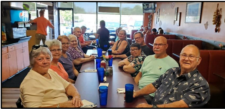
Having Friday night dinner at Marco's Italian Restaurant