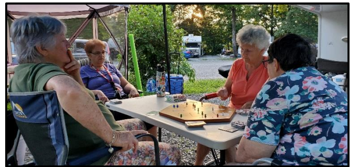
A very serious game of Fast Track