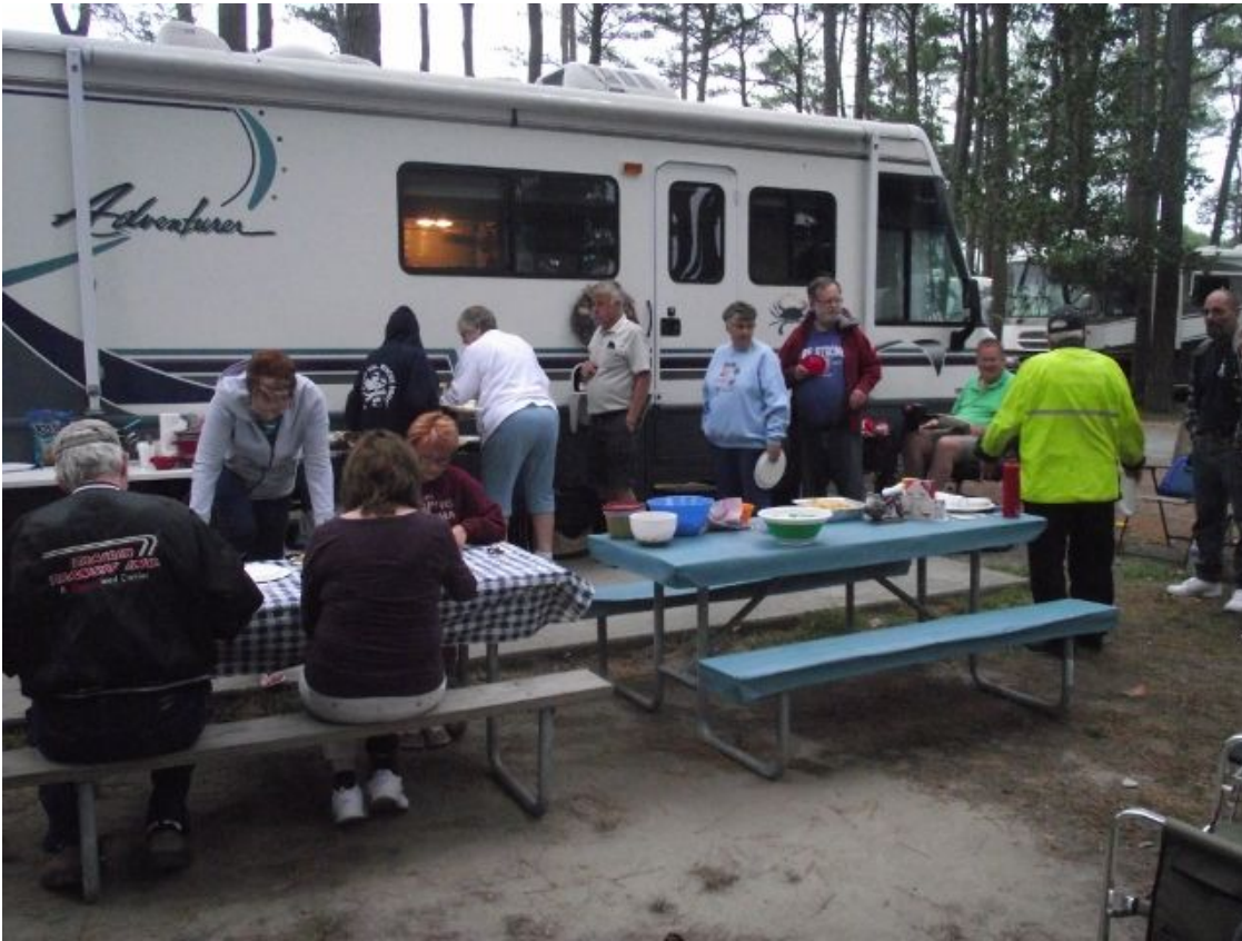
The line moved right along with way to much good food. Tacos were the featured dish for Friday dinner.