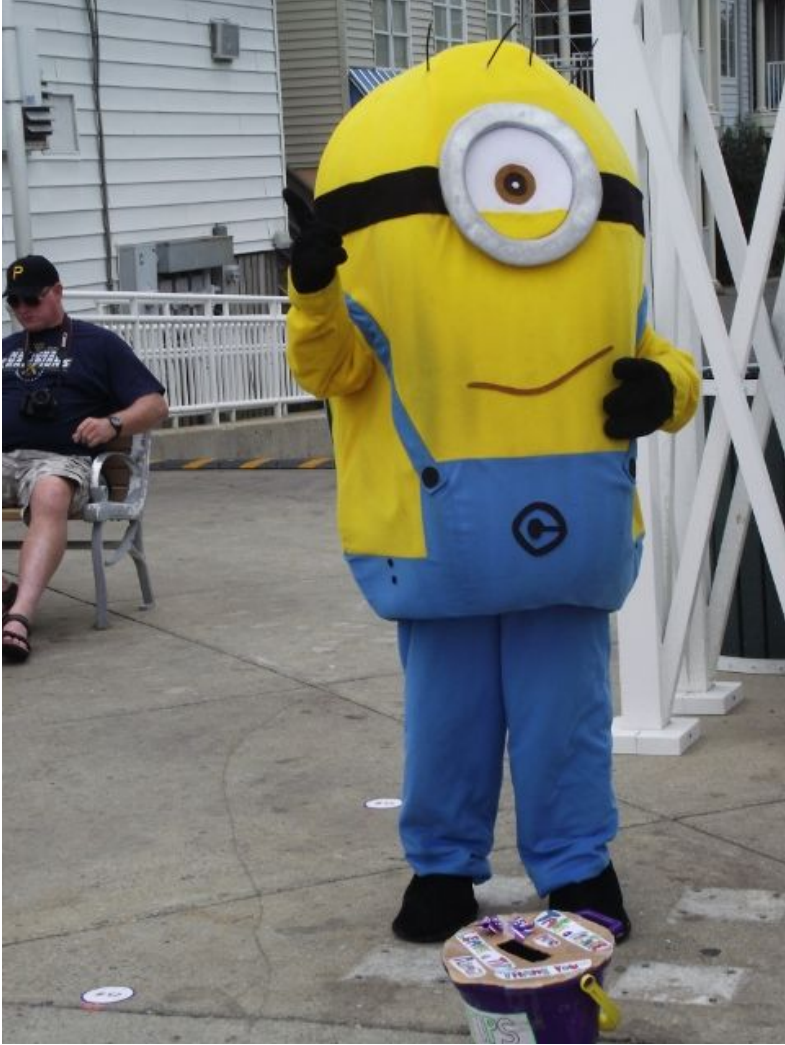
A Minion on the boardwalk looks for donations.