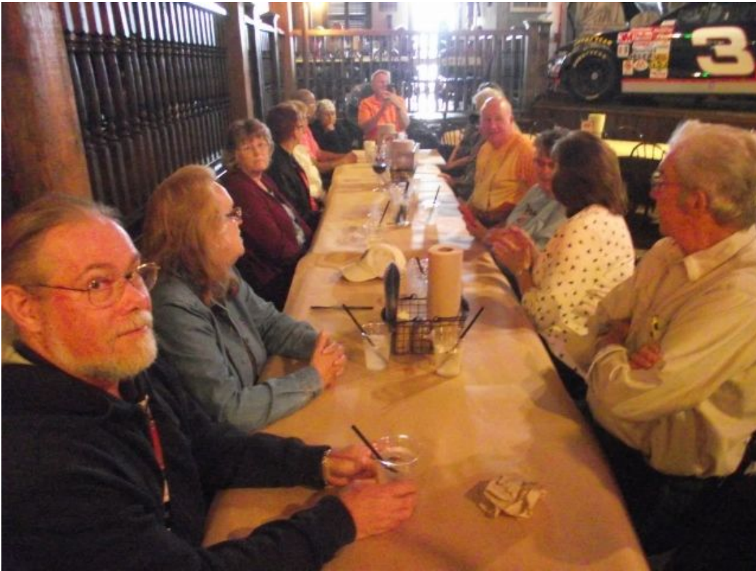
Waiting for food at Hoopers Crab House. The number 3 car was ready to roll.