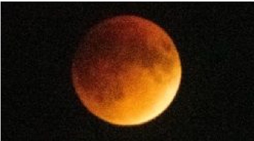
We looked in vain for the Blood Moon. Clouds obscured our view and we were also two days early. The red-orange color comes from the refraction of the sun light going through the earth's atmosphere and illuminating the moon during the lunar eclipse. This is the same red effect seen at sunrise and sunset.

Our next campout will be at Bar Harbor RV Park, 4228 Birch Ave., Abingdon, MD, on October 9-11, 2015, about 25 miles north of Baltimore, MD. 410-679-0880. http://www.barharborryvpark.com The campground is gated and no one around, but just put in the gate access code: *1963 and the gate will open wide for you. Follow the signs to the office to check in.