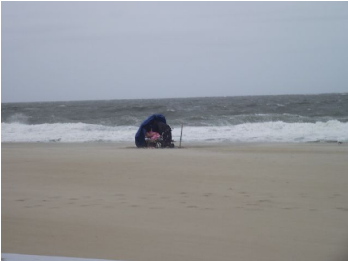
This lady was determined to work on her tan even if there was no sun that day.