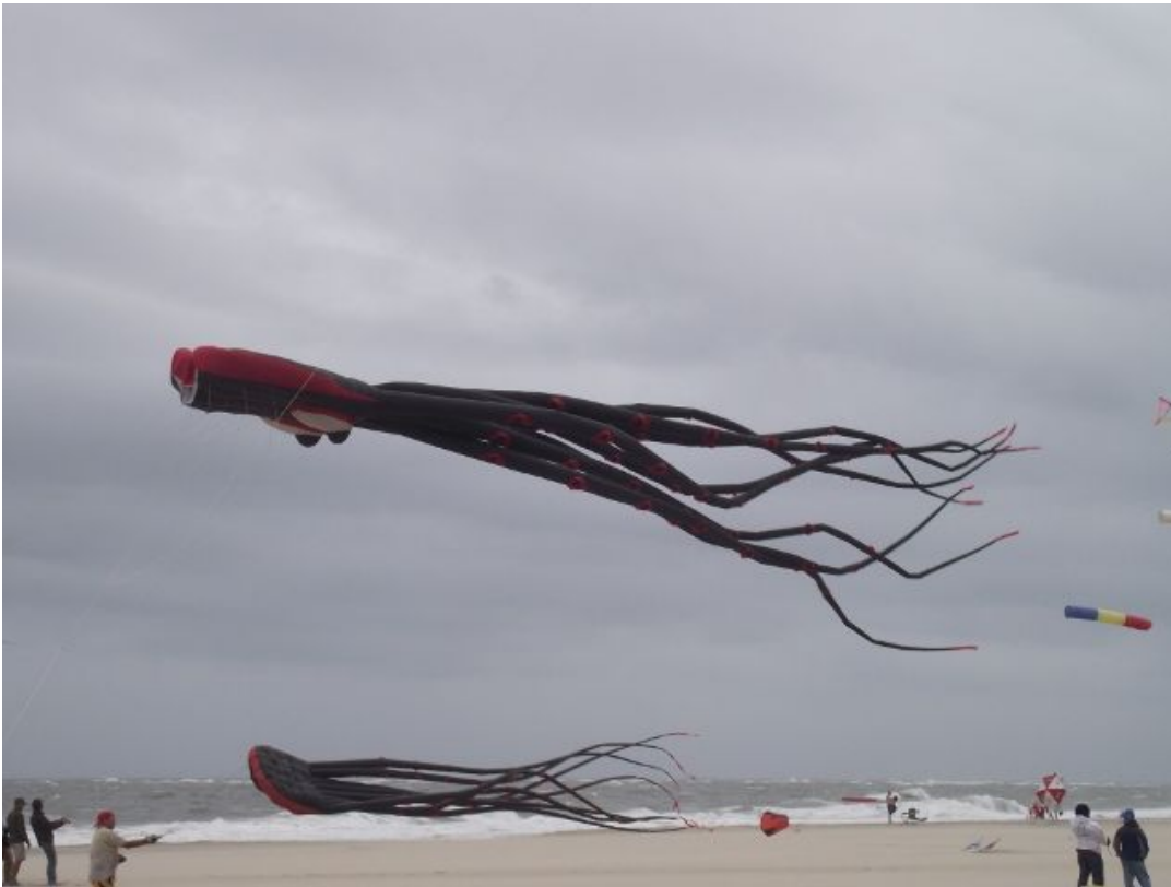
More kites on the beach: Note how most of the kite fliers are leaning back to hang on to their kites. Most of the beach goers wore long pants to protect from the stinging blowing sand.