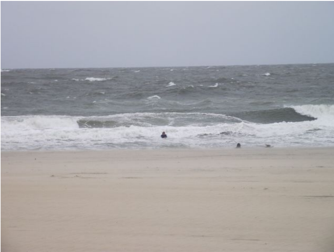
Surfers in wet suits were trying the big waves. Undertow and rip currents were a big hazard with the wind blown waves.