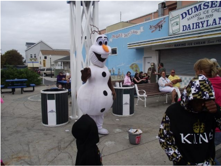
Frozen mime entertained the crowds.