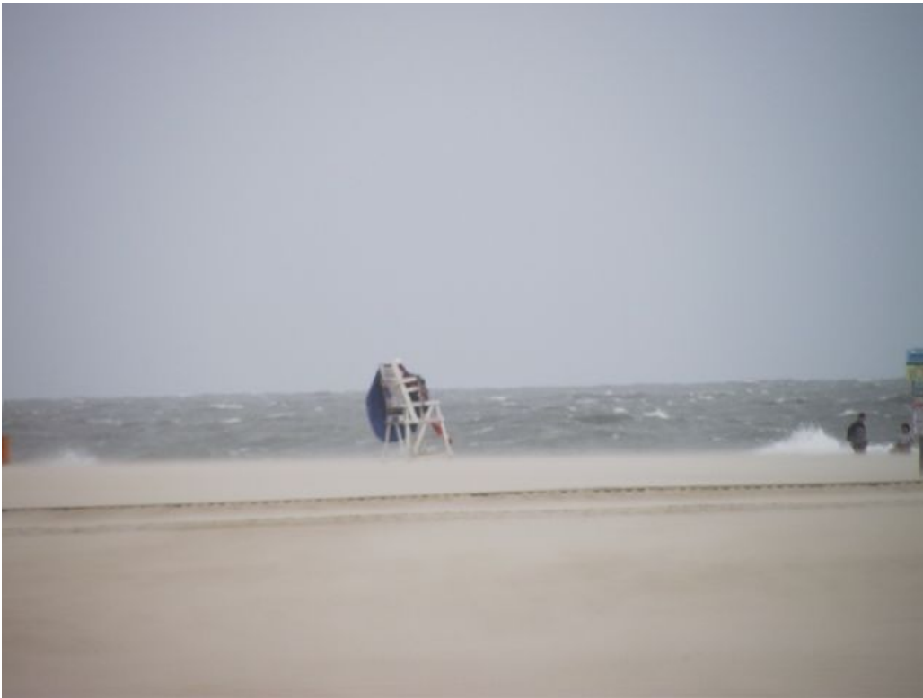
High winds and surf were the order of the day on the beach. The lifeguard was using his umbrella as a wind shield. Part of the fuzz in this picture at the life guard stand is from blowing sand.