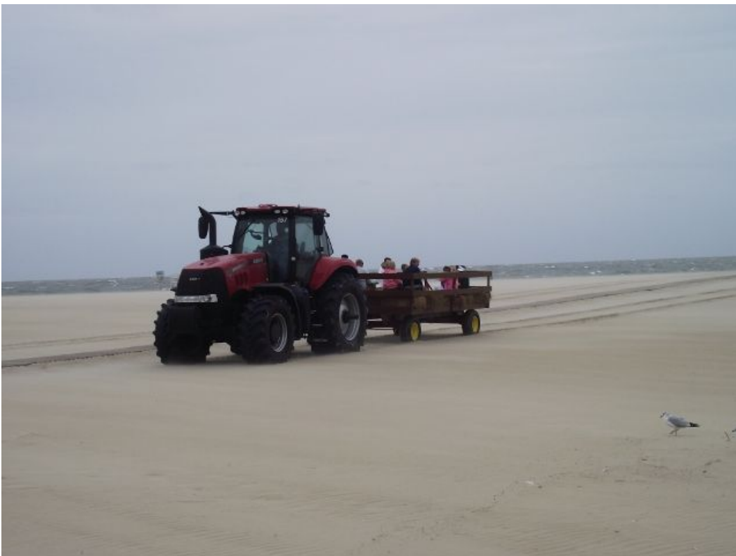
Going for a tractor ride on the beach seemed quite popular. This same tractor will be used to pull huge rakes to sift the beach sand to remove trash and debris when the tourists leave. Money collected from wagon rides helps to offset the costs of the beach grooming.