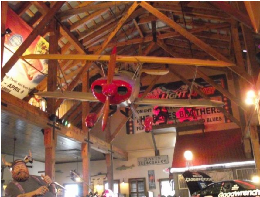
At Hoopers all manner of ambience can be found in the barn.