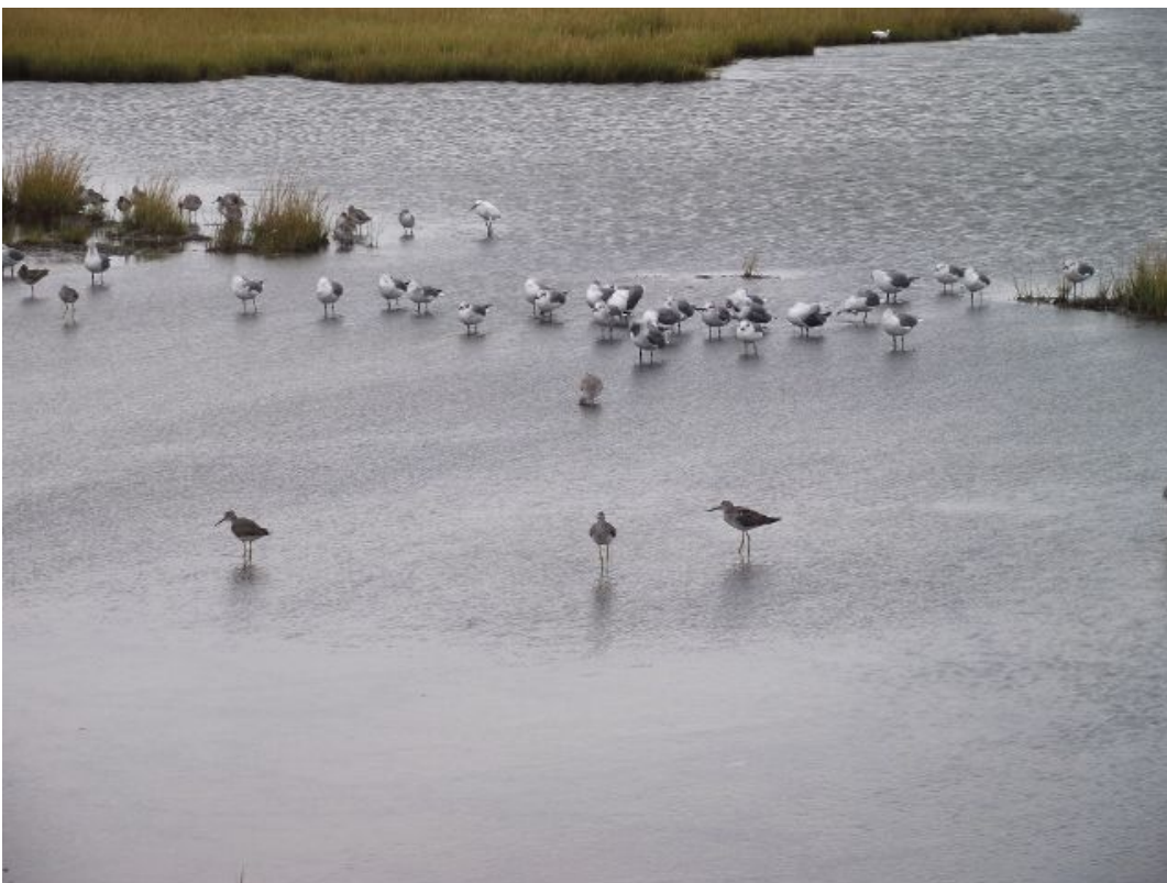
Sand Pipers, sea gulls and a few cranes take it easy in the shallow water at the campground waterfront.