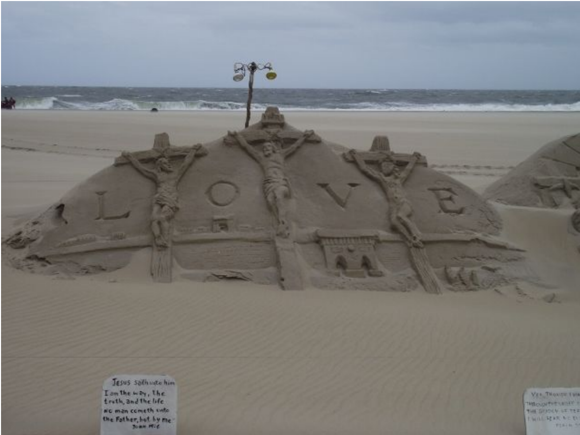
Sand art on the beach was steadily being eroded by the wind.