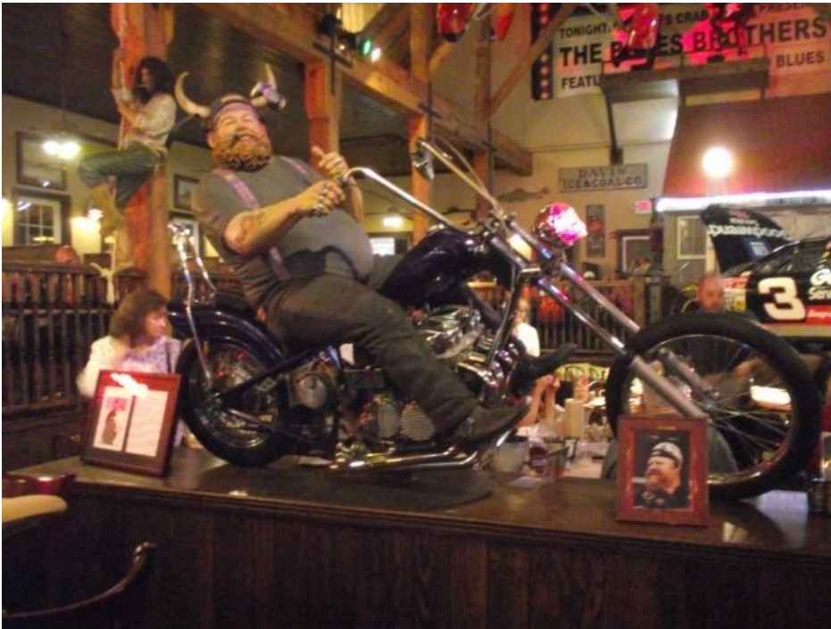
This biker was a left over from Bike Week at Ocean City the week before our arrival.