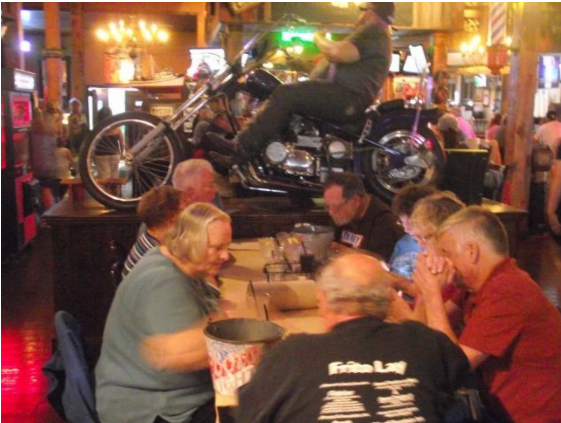
Table 2 at Hoopers waiting for crabs.