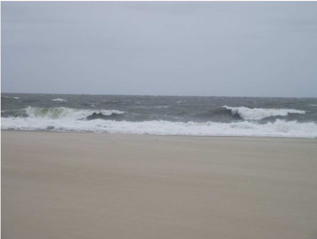
Eight to ten foot waves were breaking all day Saturday.