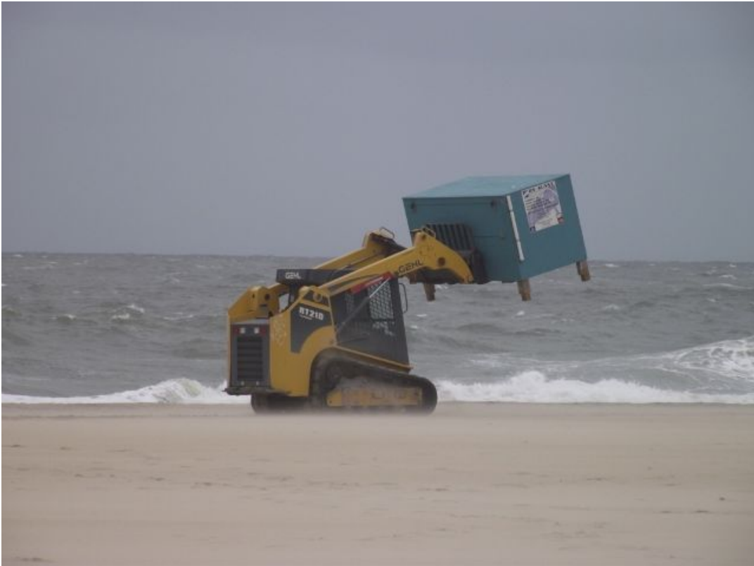
Heavy skid loaders are used to remove the life guard equipment boxes as the swim season winds down.