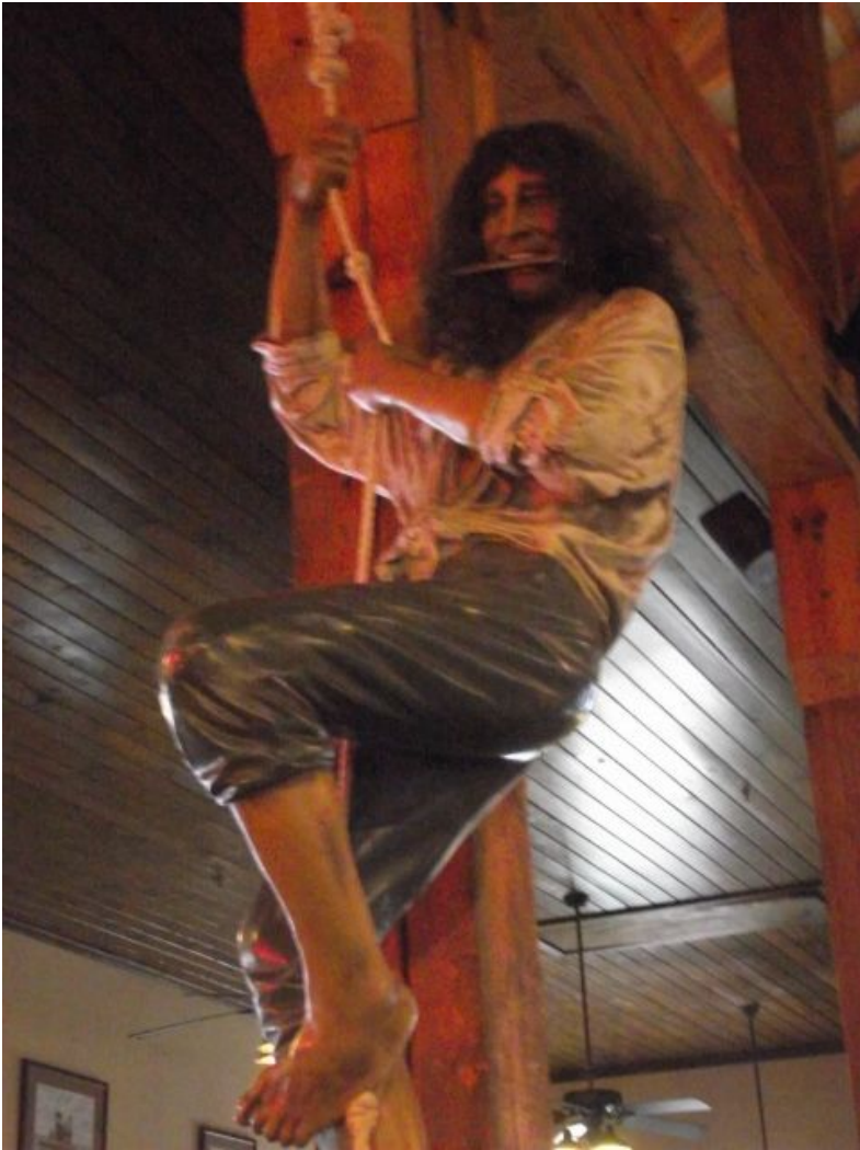
This pirate descends from the rafters at Hoopers.