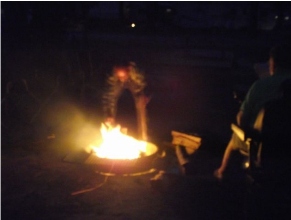
After dinner on Friday night Greg kept the fire going in the strong northeast wind that blew all weekend.