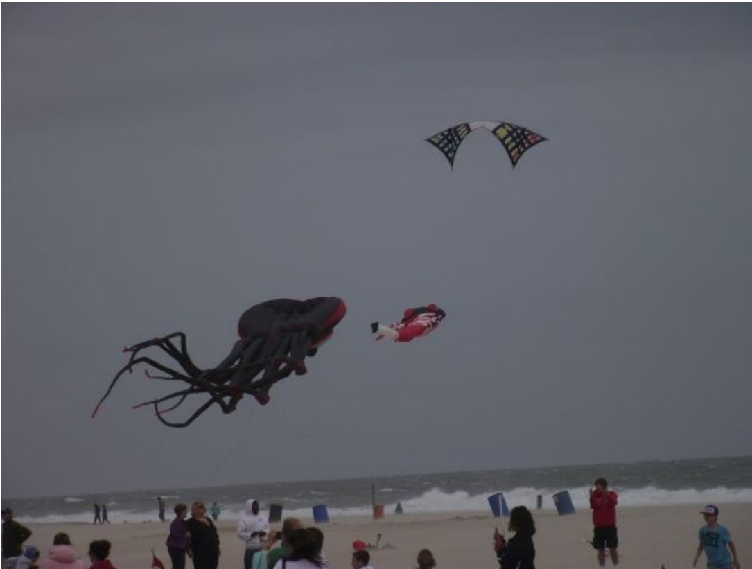
It was a great weekend for flying kites on the beach. The winds may have been too strong for some of the bigger kites.