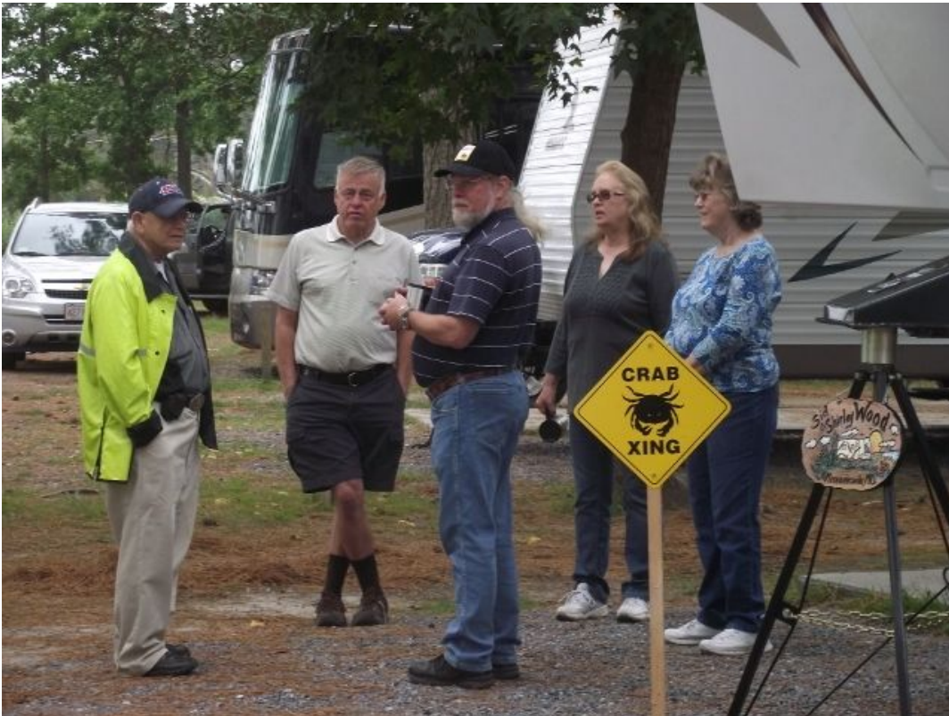
Strategy group session on Saturday morning.