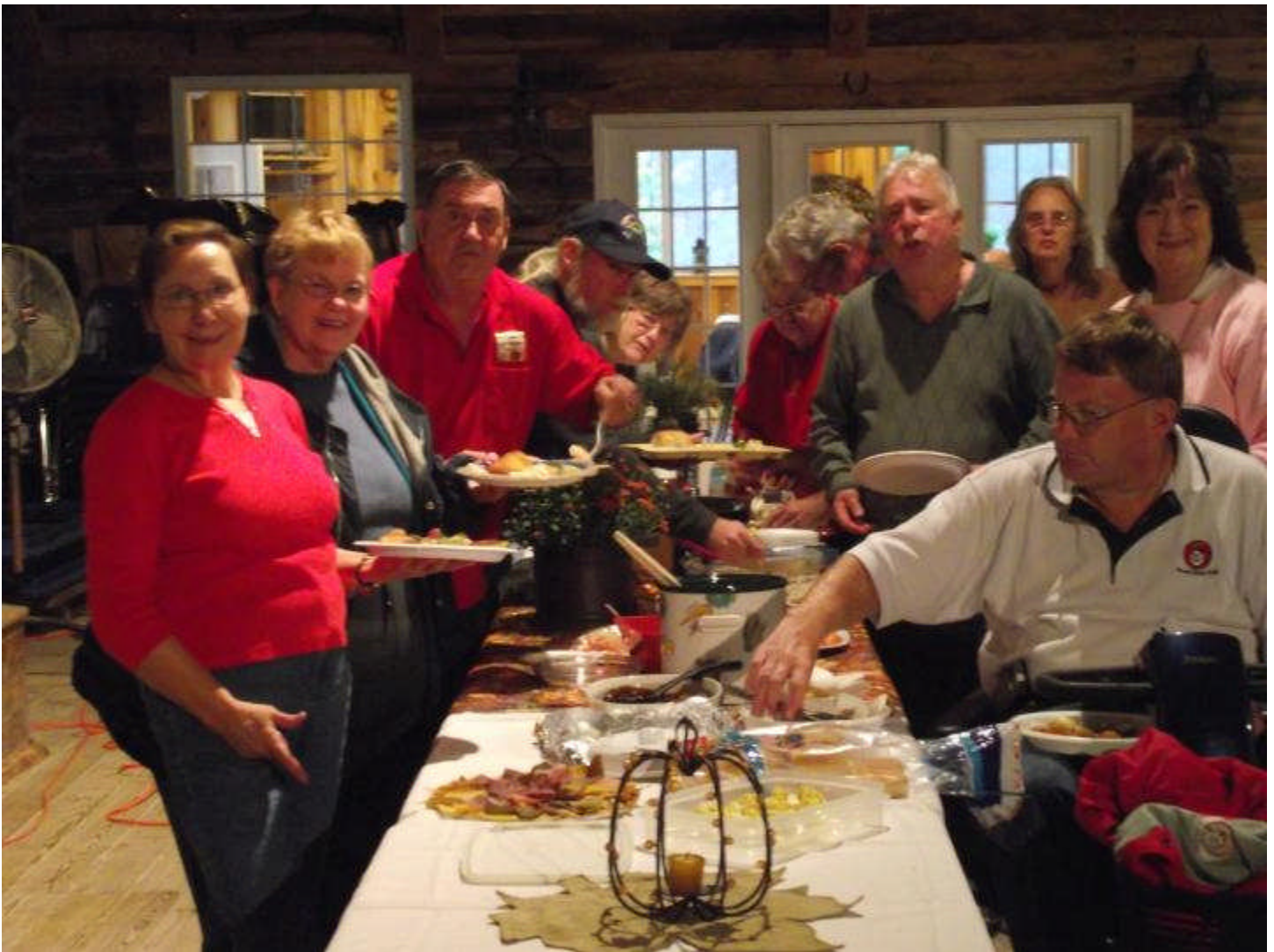
Blue Crabs doing what they do best.