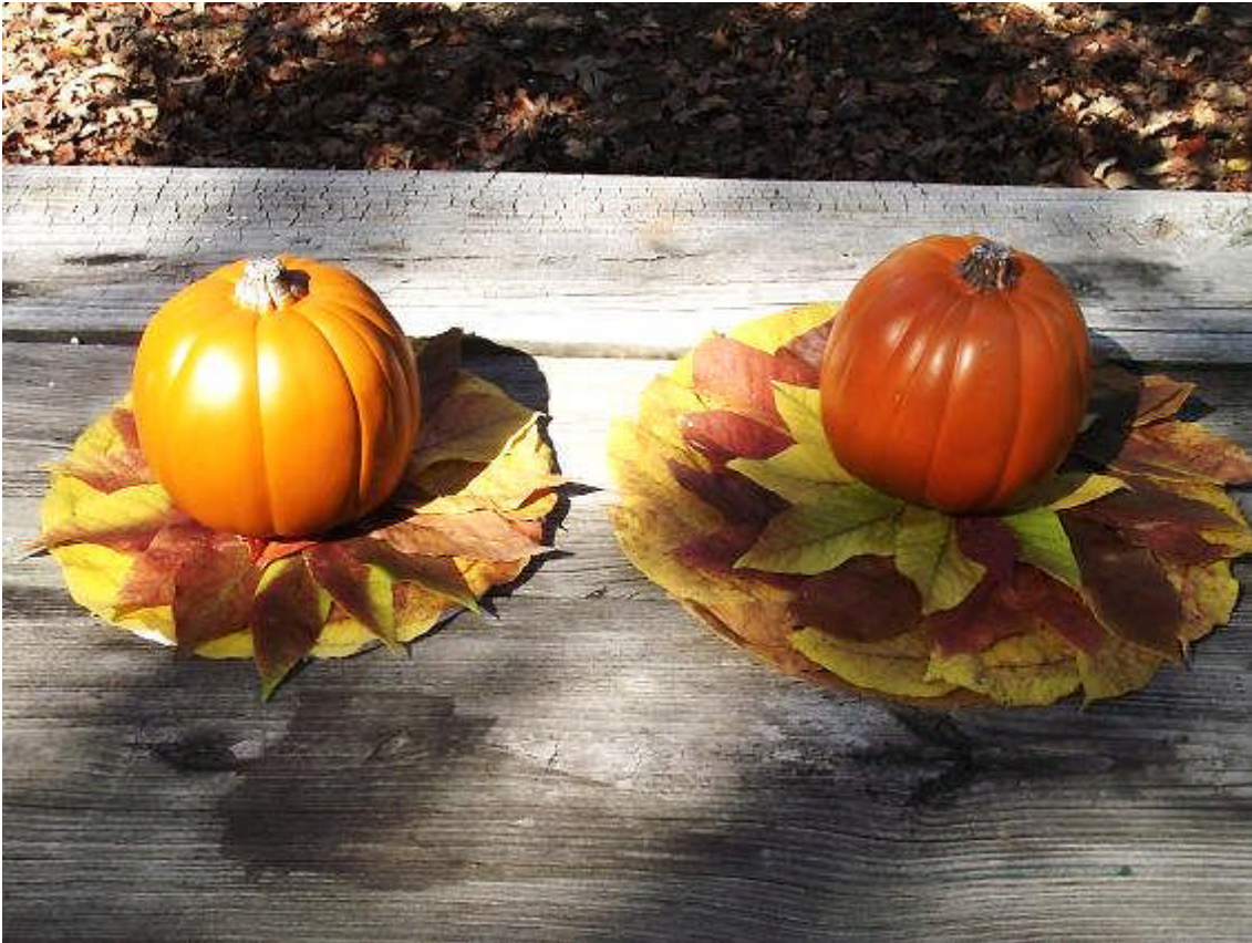
Finished leaf displays make nice table decorations. The leaves will curl and soon fade to brown.