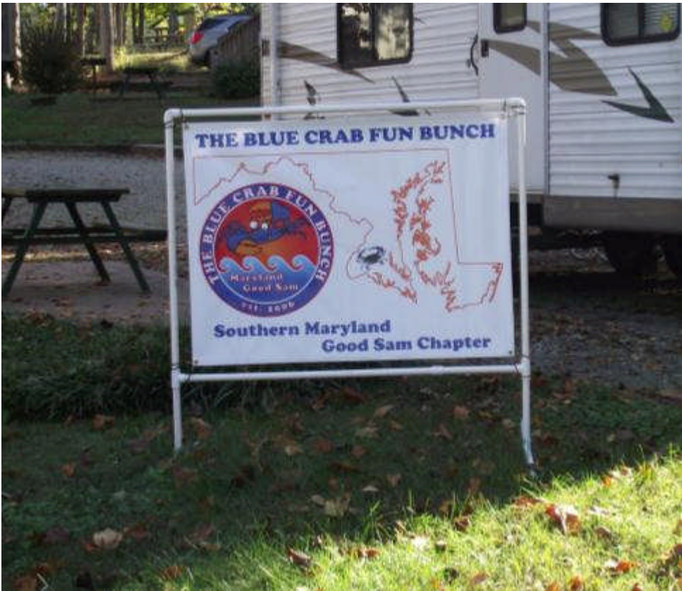
Our new Chapter Banner.