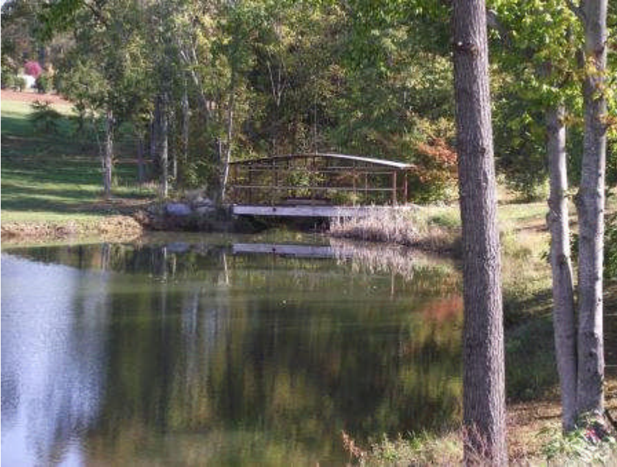
Covered footbridge on the hiking trail crosses the catfish pond.

Shirley and I set out on Friday, October 12, 2012, at 9:30 AM for Cozy Acres campground at Powhatan, VA. This trip took us two and one-half hours on Interstate and dual-lane highways until about ten miles out on Rt. 60 then left turn onto VA State Rte. 627. Dick, Eve, Shirley and I co-hosted this campout. We had seven rigs attending. All the sites are wooded with lots of poplar, maple, gum, dogwood, cedar, pine, ironwood and walnut trees. Fortunately, there were no oak trees to drop acorns on us. And no walnut trees at the campsites to drop walnuts on us either. This time of year the oak and walnut trees are dropping their nuts; sounds like someone dropping rocks on the camper roof.