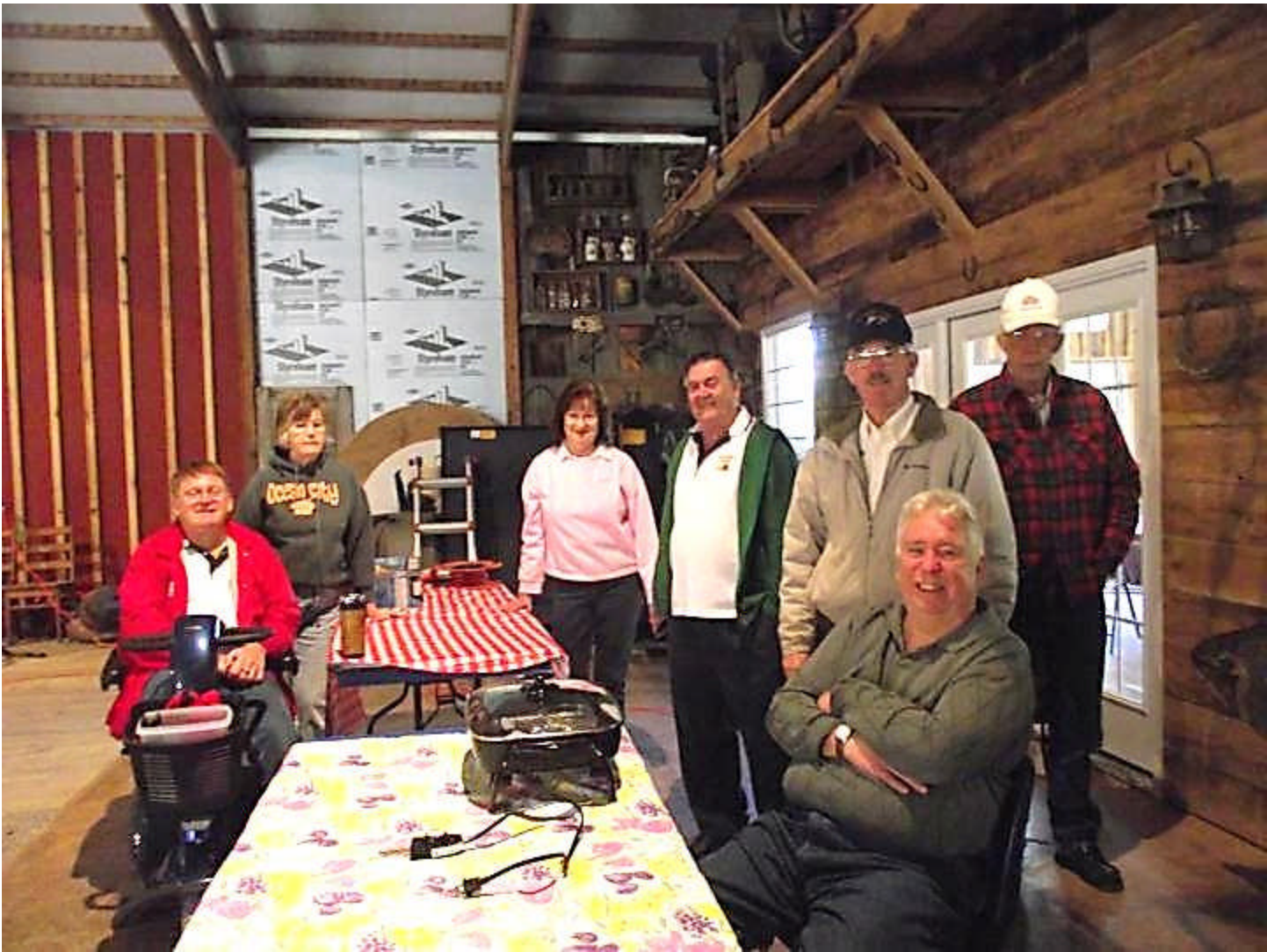
All cleaned up after breakfast. Eve took this picture.