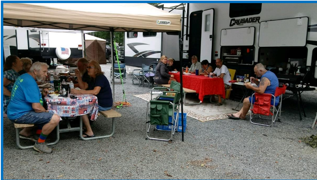
Saturday afternoon dinner and meeting at the hosts campsite.