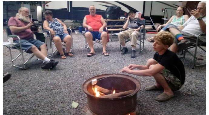
Some roasting go on