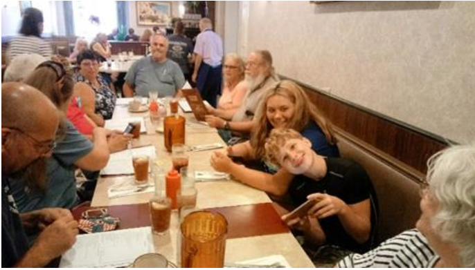
Friday night dinner at Hamiltons