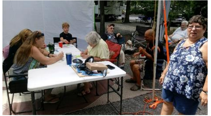
Arts and Crafts at the campsite