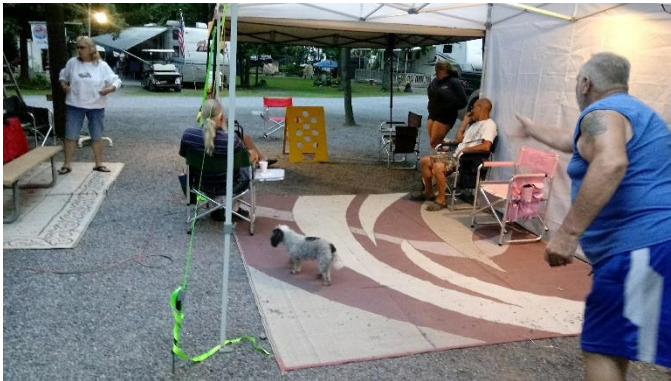
Enjoying a game of Corn Hole Baseball